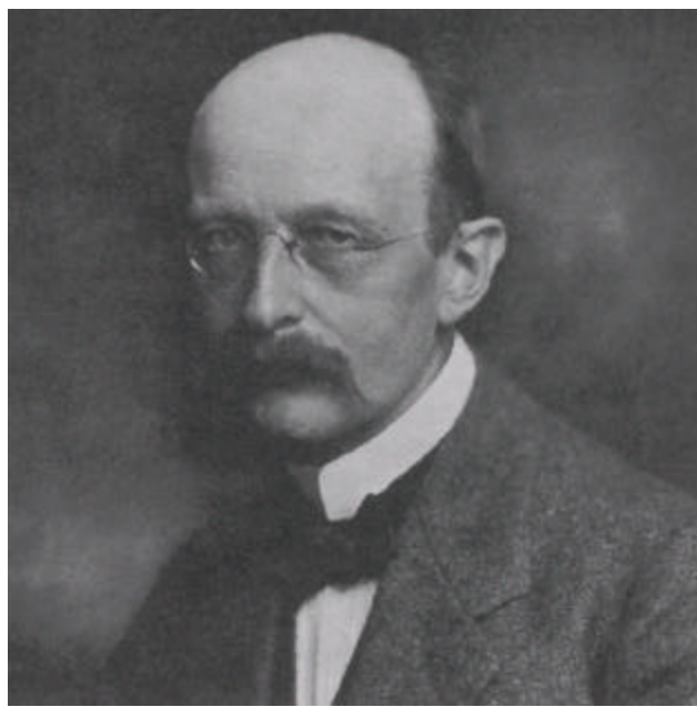
MAX PLANCK (1858-1947) introduced the idea that electromagnetic radiation consists of quanta, or particles. This photograph was made in 1913, 13 years after his original paper

know how to calculate results and how to compare the results of their calculations with experiment. Everyone is agreed on the formalism. It works so well that nobody can afford to disagree with it. But still the picture that we are to set up behind this formalism is a subject of controversy.