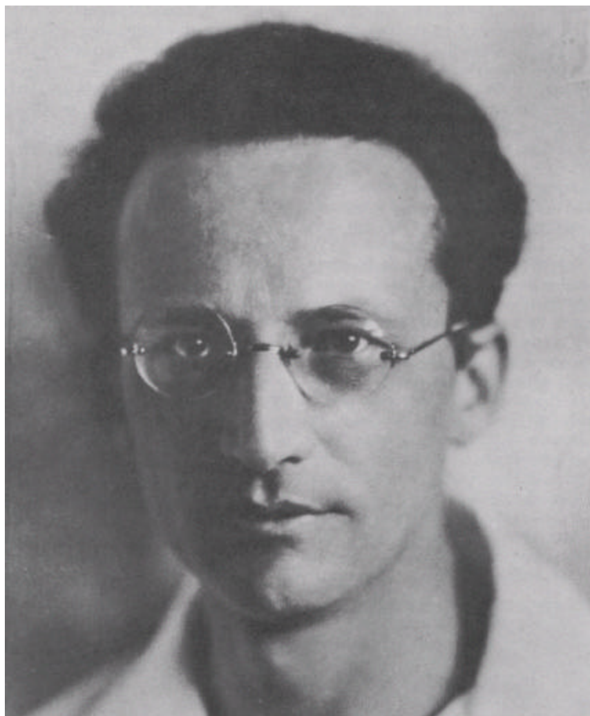
ERWIN SCHRODINGER (1887-1961) devised his wave equation by extending De Broglie's idea that waves are associated with particles to the electrons moving around the nucleus. This photograph was made in 1929, four years after he had published his second equation.

That is one idea for the development of physics in the future that would