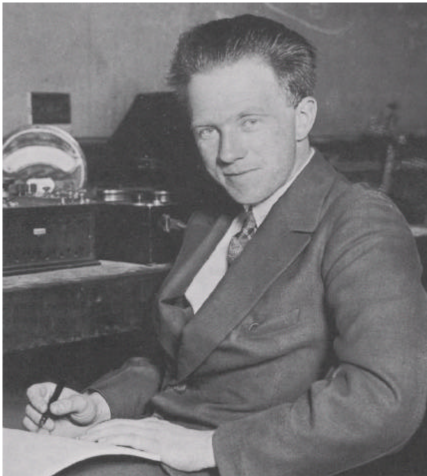
WERNER HEISENBERG (1901- ) introduced matrix mechanics, which, like the Schrödinger theory, accounted for the motions of the electron. This photograph was made in 1929.

This picture of the extended electron has been stimulated by the discovery of the mu meson, or muon, one of the new particles of physics. The muon has the surprising property of being almost identical with the electron except in one particular, namely, its mass is some 200 times greater than the mass of the electron. Apart from this disparity in mass the muon is remarkably similar to the electron, having, to an extremely high degree of accuracy, the same spin and the same magnetic moment in proportion to its mass as the electron does. This