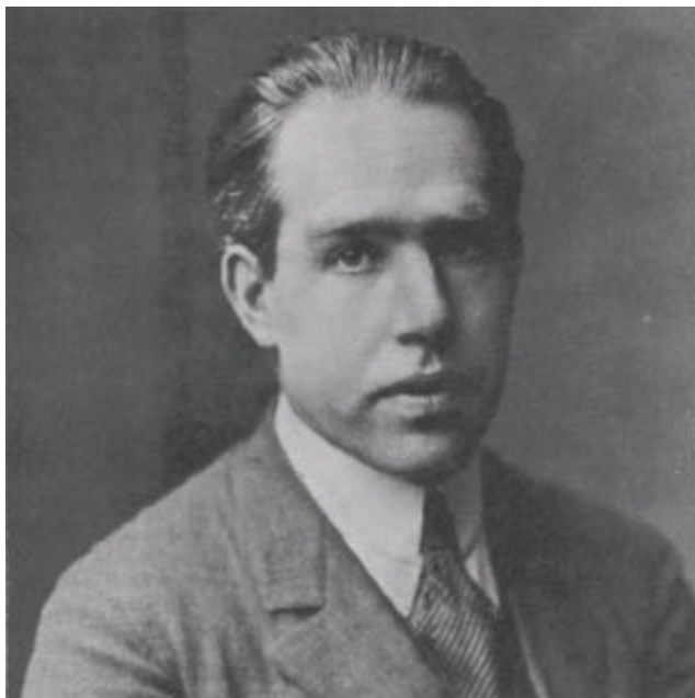
NIELS BOHR (1885-1962) introduced the idea that the electron moved about the nucleus in well-defined orbits. This photograph was made in 1922, nine years after the publication of his paper.