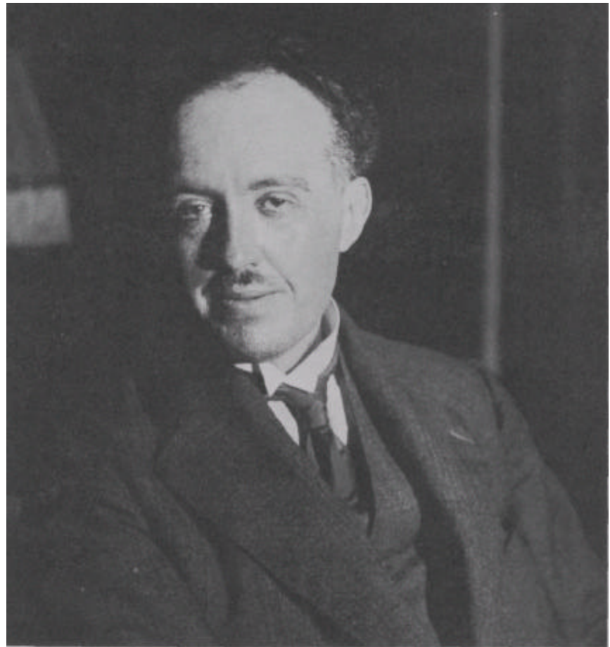
LOUIS DE BROGLIE (1892- ) put forward the idea that particles are associated with waves. This photograph was made in 1929, five years after the appearance of his paper.

I shall merely explain the idea in words. We start out with a theory involving equations. In these equations there occur certain parameters: the charge of the electron, e , the mass of the electron, m , and things of a similar nature. One then finds that these quantities, which appear in the original equations, are not equal to the measured values of the charge and the mass of the electron. The measured values differ from these by certain correcting terms— \Delta e , \Delta m and so on—so that the total charge is e + \Delta e and the total mass m + \Delta m . These changes in charge and mass are brought about through the interaction of our elementary particle with other things. Then one says that e + \Delta e and m + \Delta m , being the observed things, are the important things. The original e and m are just mathematical parameters; they are unobservable and therefore just tools one can discard when one has got far enough to bring in the things that one can com-